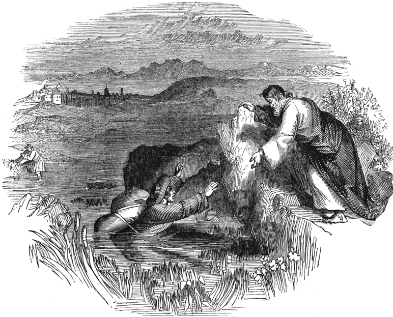
Christian in the Slough of Despond

And with that, he gave a desperate struggle or two, and got out of the mire on that side of the slough, which was next to his own house. So away he went, and Christian saw him no more.