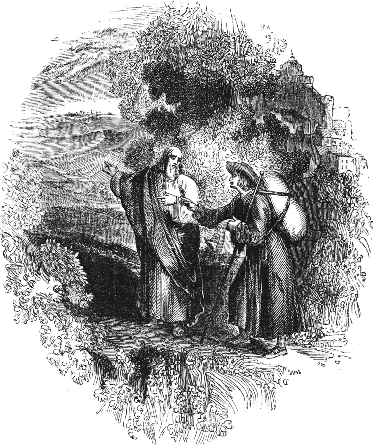
Christian Meets Evangelist

the children of my bowels, I, your dear friend, am in myself undone, by reason of a burden that lieth hard upon me; moreover, I am for certain informed that this our city will be burnt with fire from heaven; in which fearful overthrow, both myself, with thee my wife, and you my sweet babes, shall miserably come to ruin, except (the which yet I see not) some way of escape can be found, whereby we may be delivered."