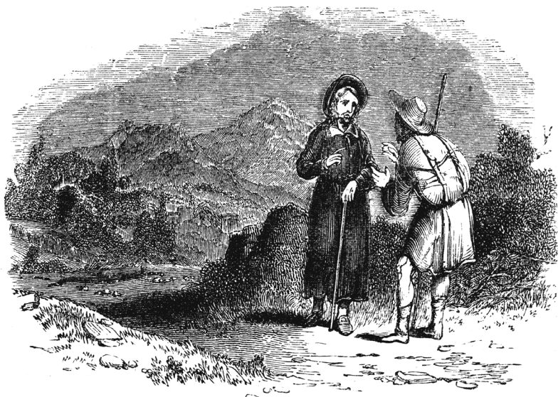
Christian Meets Mr. Worldly Wiseman

CHRISTIAN: "A burdened manner indeed, as ever I think poor creature had. And whereas you ask me, Whither away? I tell you, sir, I am going to yonder Wicket gate before me; for there, as I am informed, I shall be put into a way to be rid of my heavy burden."